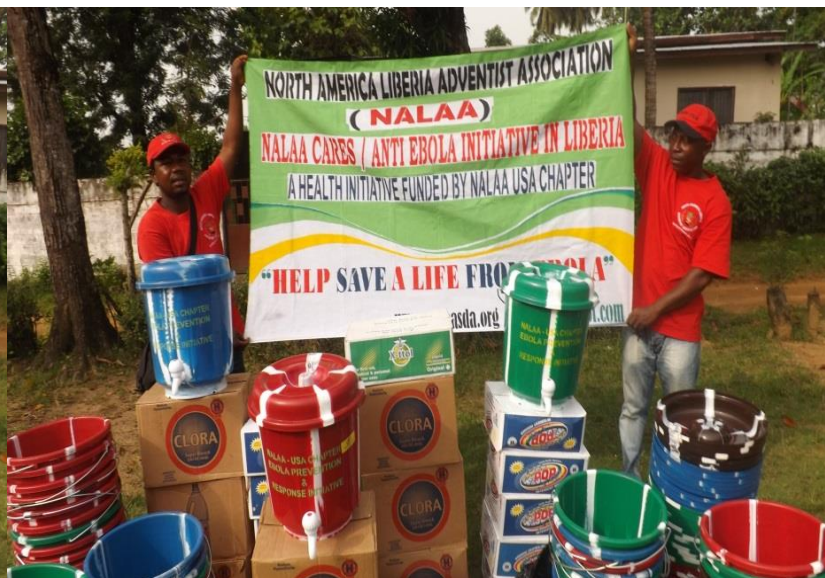
ANTI – EBOLA MATERIALS