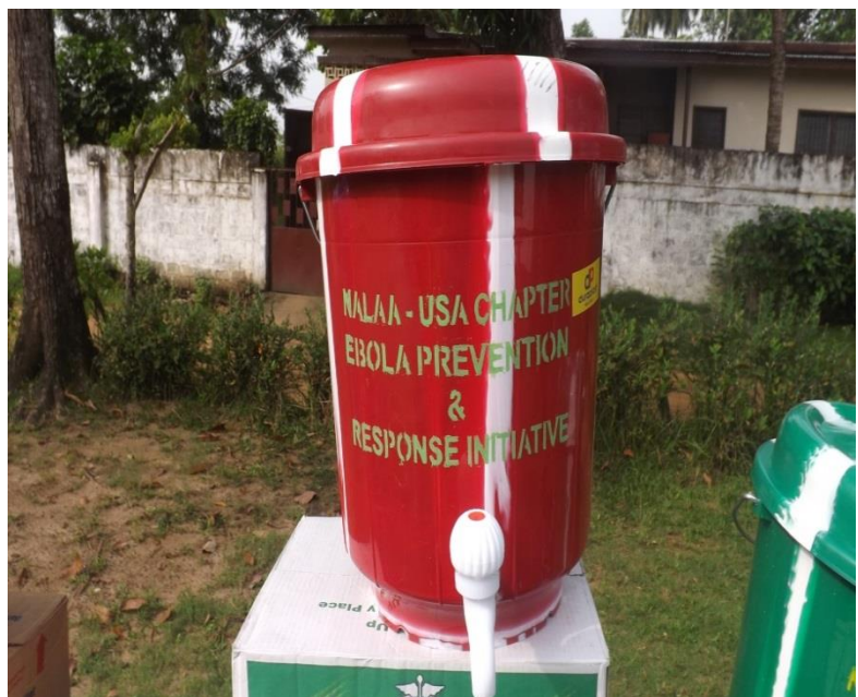
BUCKET FOR HAND WASHING