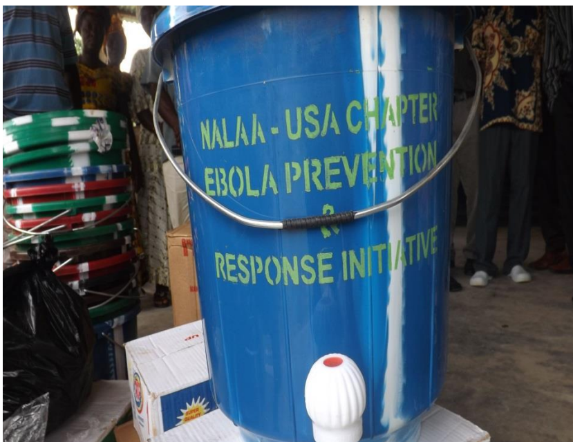
BUCKET FOR HAND WASHING