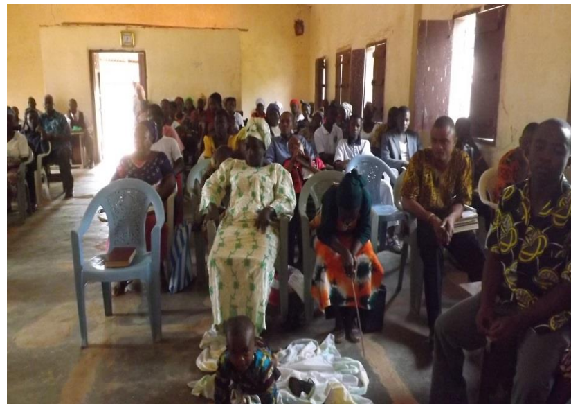
CROSS SECTION OF KAKATA CHURCH