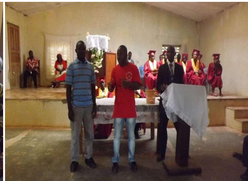
NALAA TEAM MAKING PRESENTATION