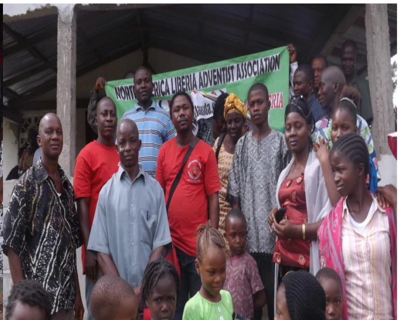
TEAM POSED FOR PHOTO WITH MEMBERS