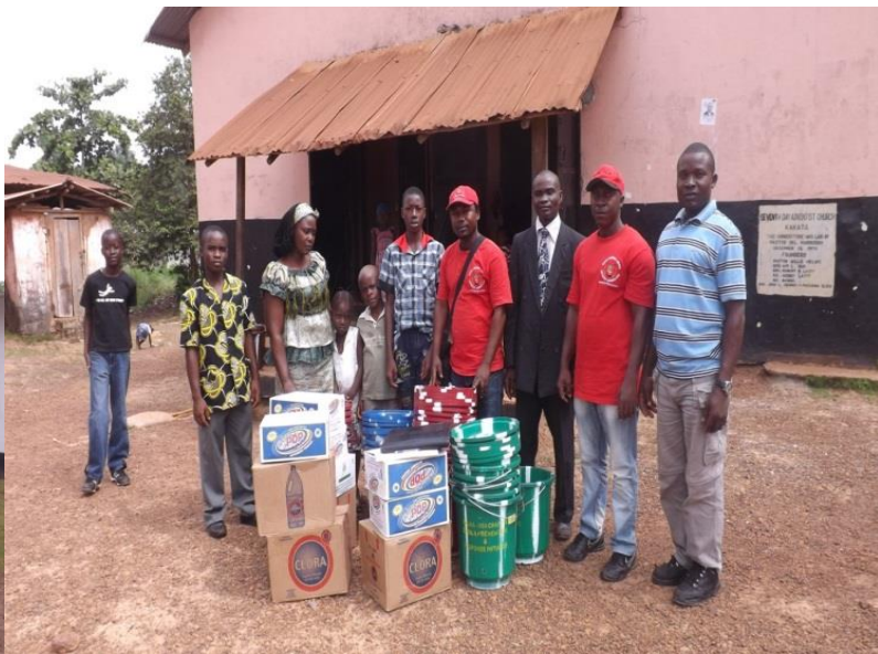
NALAA TEAM AND CHURCH MEMBERS