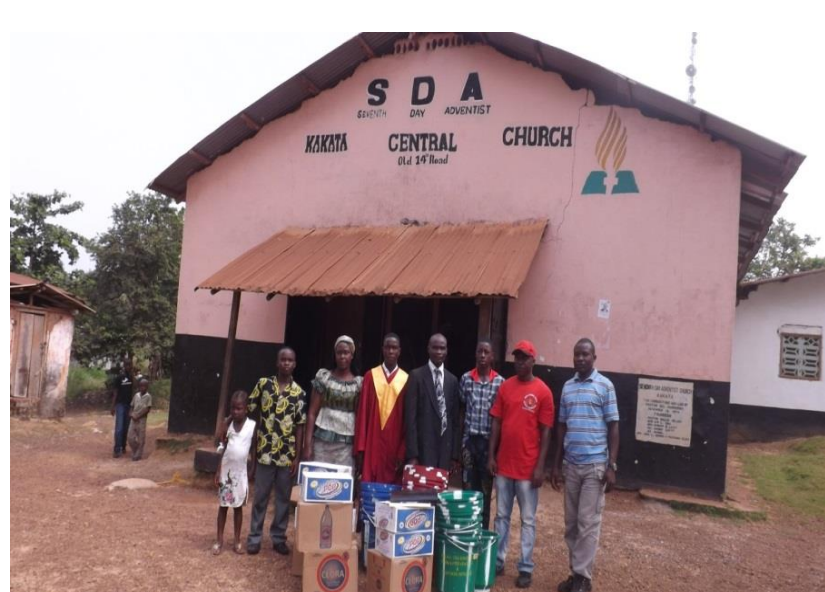
AT THE 14 TH ROAD CHURCH, KAKATA