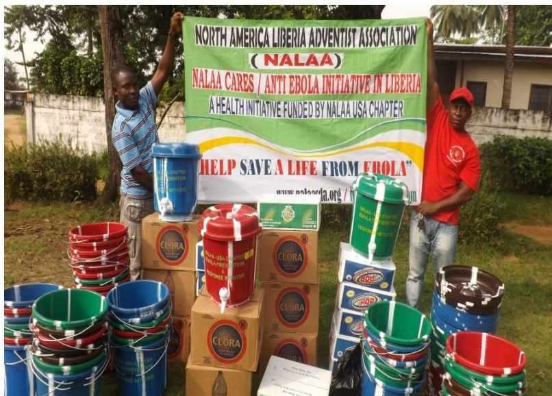
ANTI – EBOLA MATERIALS