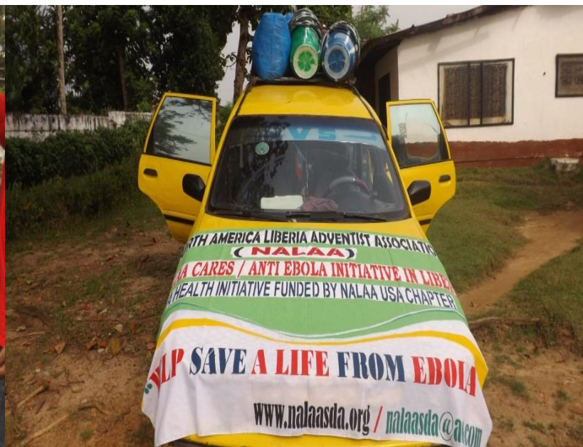
TEAM READY FOR FIELD TRIP