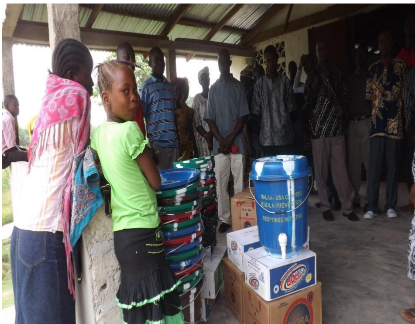
AT THE REAPING SDA CHURCH, GBARNGA